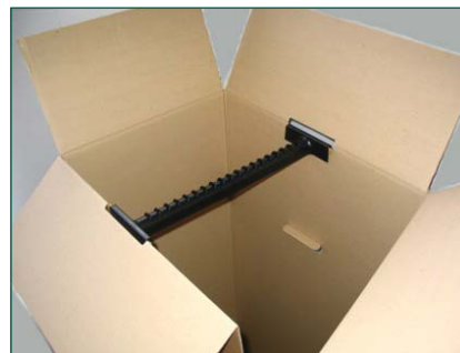
Master Rail is easy to fit