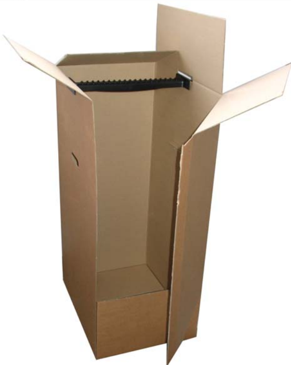
Master Rail in use in a wardrobe removals box