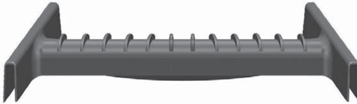
12" Maxi rail (30cm)