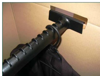
Master Rail ribs prevent movement of garments in transit